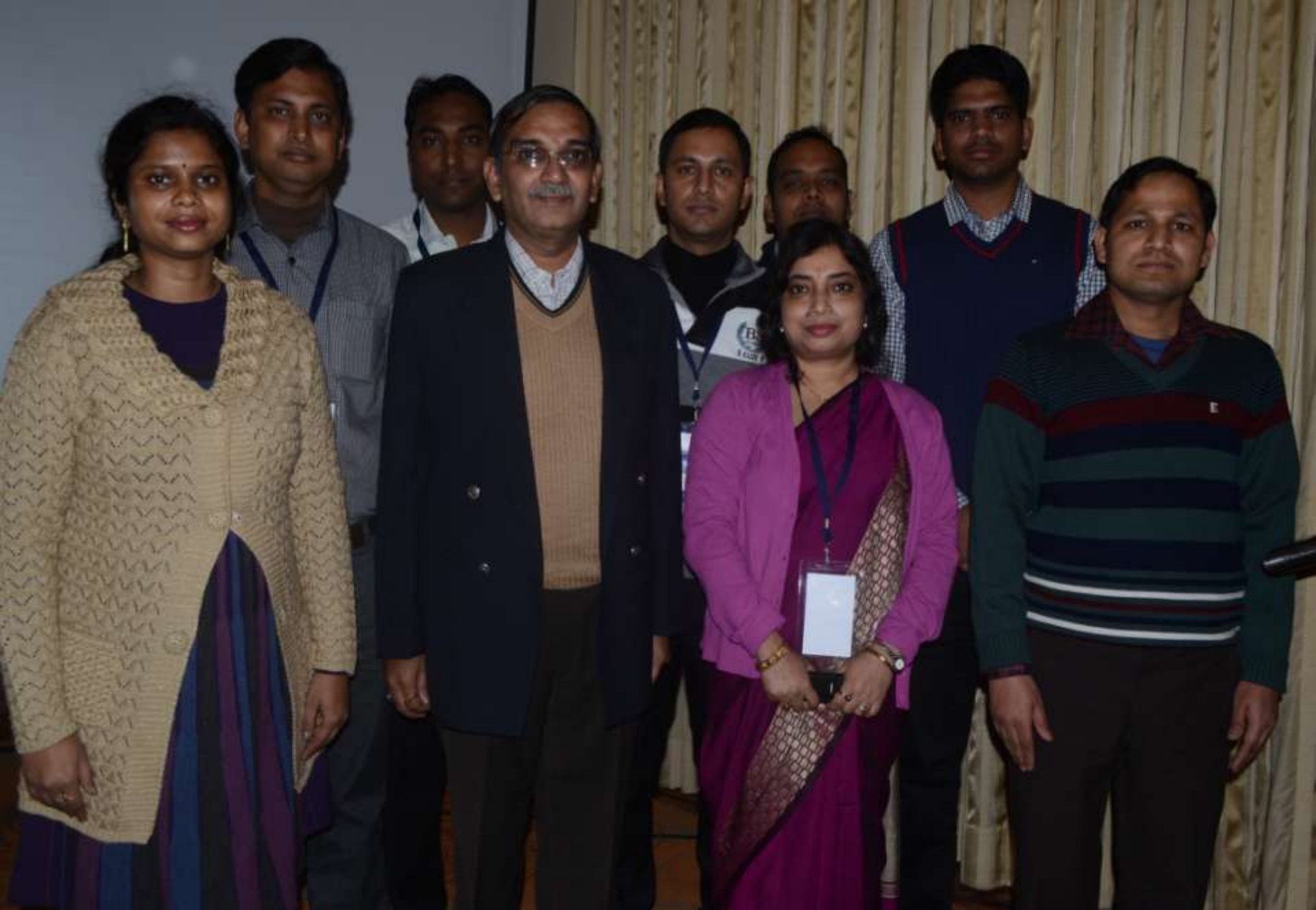
Organizer of the workshop