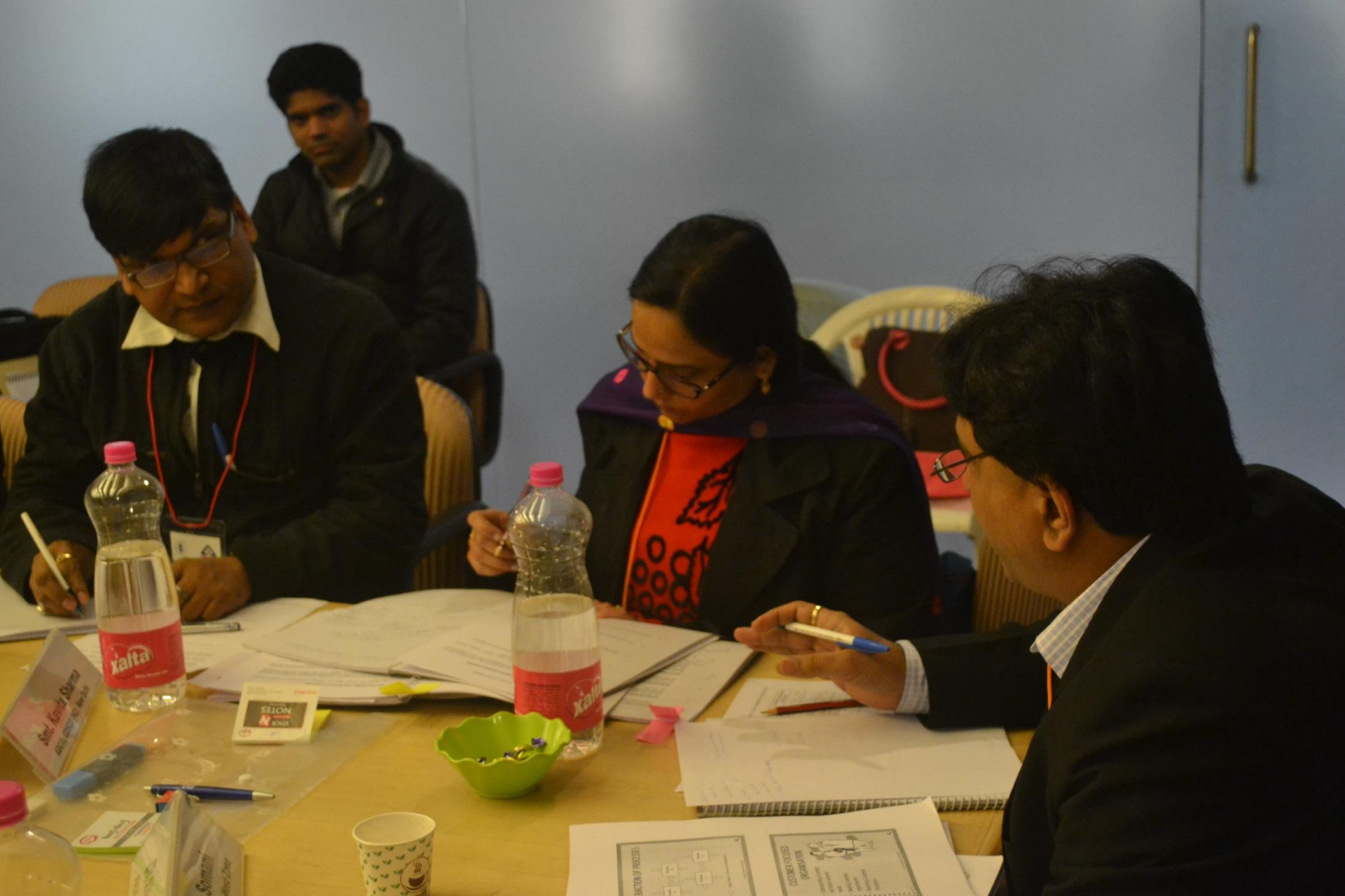
Discussion amongst the participants during the workshop on Practical sessions of Mock audit.