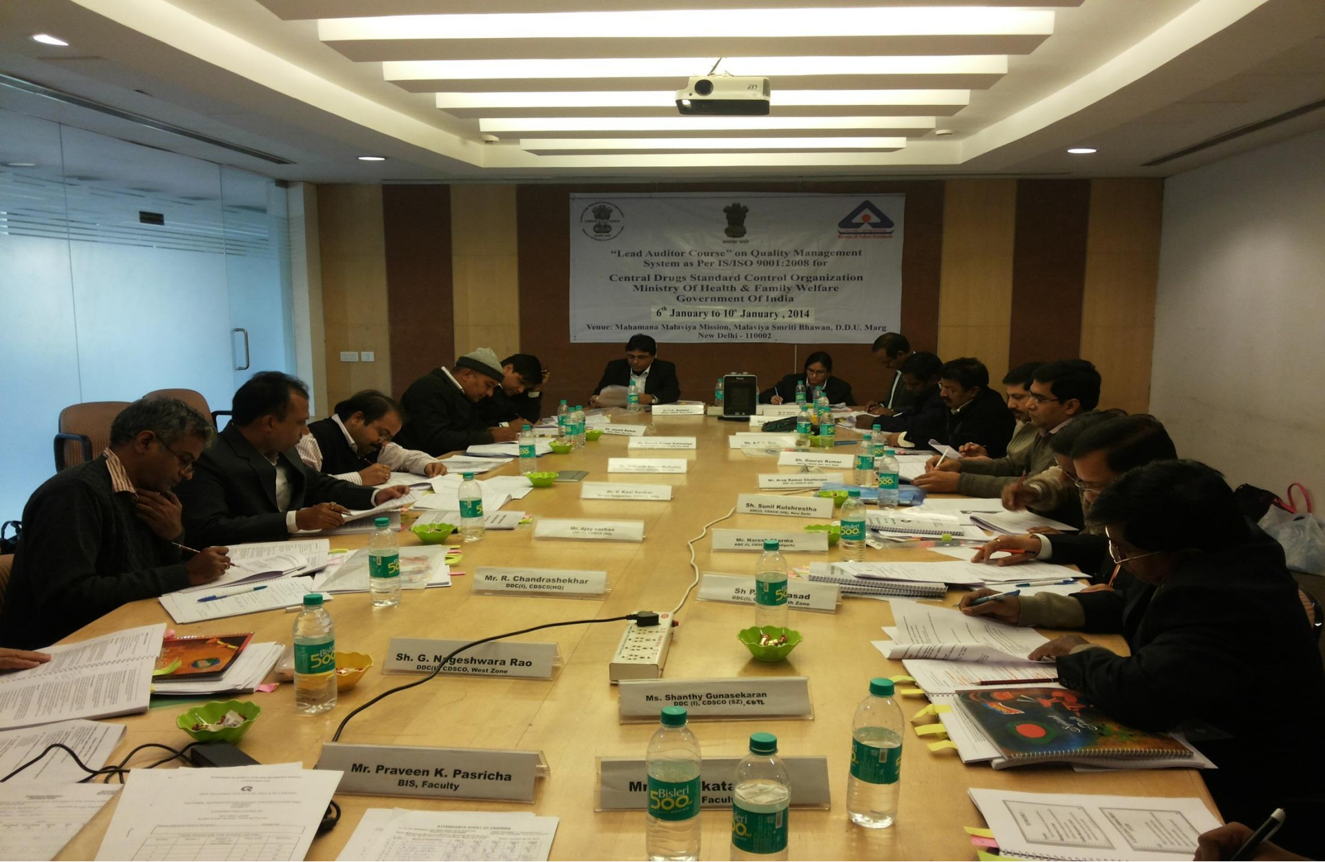
Post assessment of the participants on the fifth day.