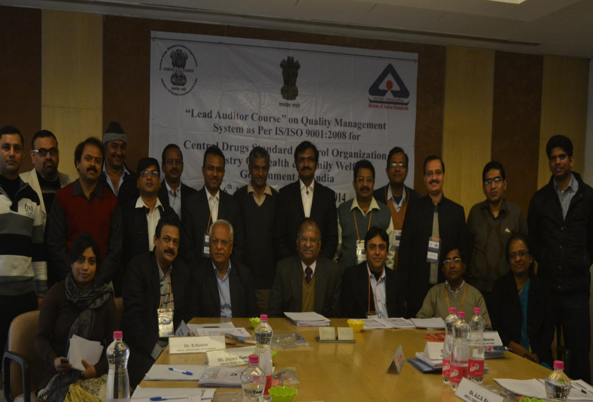
Photo Session with all the Faculties & Participants