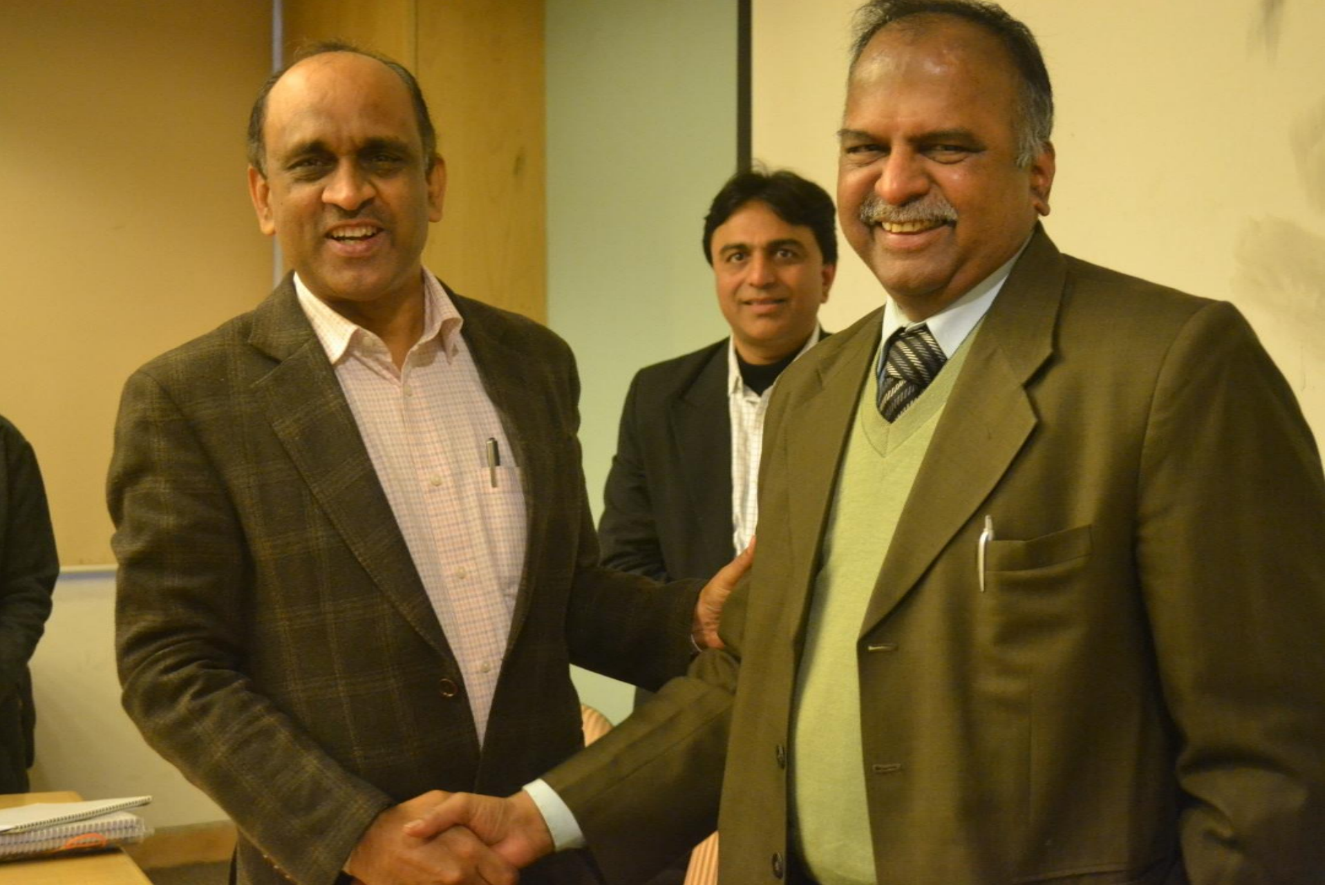
The five day programme was concluded with promising vote of thanks from Drugs Controller General (India)